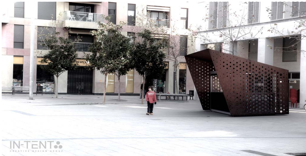
CGI image by © estudibasic